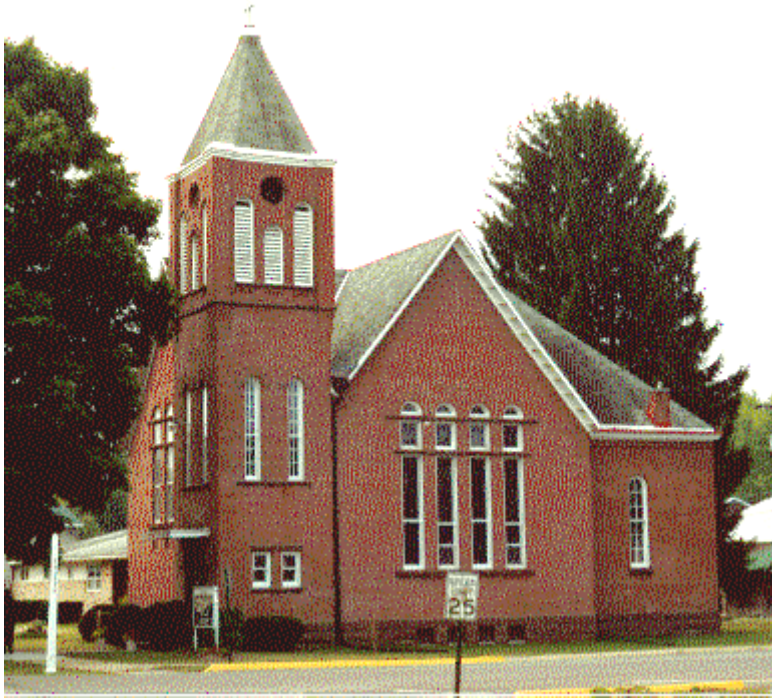
St. Ann Church in Dresden